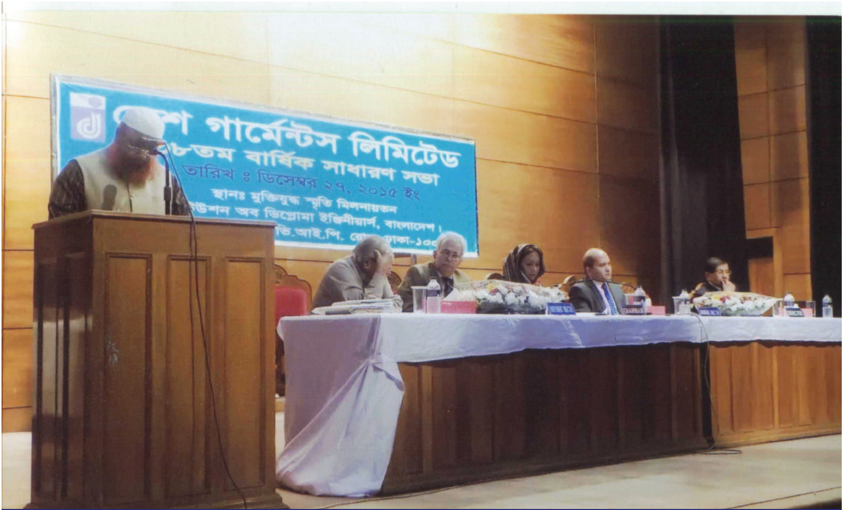
Thirtyeighth Annual General Meeting