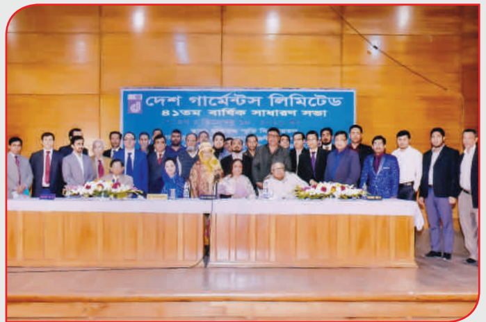
41 th Annual General Meeting